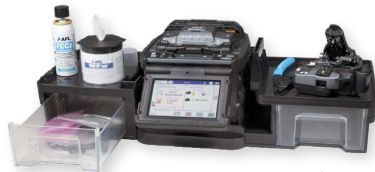
In Work Tray

When splicing loose buffer fiber, additional sheath clamps are not needed. The standard universal sheath clamp now handles both loose and tight buffer fibers. The new Active Fusion Control (AFC) technology improves splice losses for fibers that possess a poor cleave angle. Combined with Active Blade Management between the splicer and cleaver, the Fujikura 90S+ contains a robust set of splicing features that will reduce the likelihood of poor splice installations or repairs.