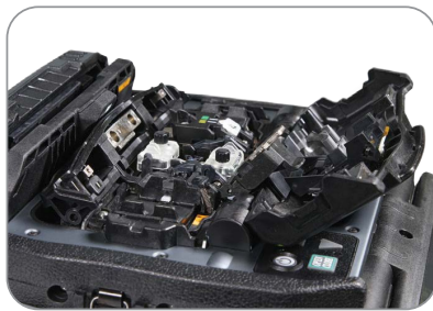
Wind Protector Open