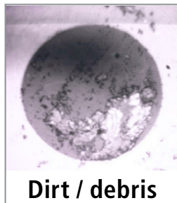
Dirt / debris