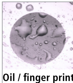
Oil / finger print