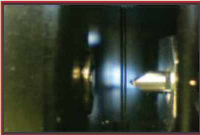
LCC II-A / LCC II-S Vision System