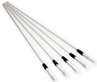
Type 2.5 mm