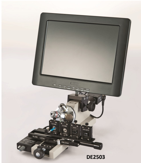
Monitor and adapters sold separately

Our Domaille Engineering OptiSpec® DE2503 video microscope is designed for large and small fiber optic cable assembly companies. The DE2503 accommodates bare fiber inspection as well as all of the standard connectors including the entire MT series of multi-fiber connectors. Blue LED illumination control eliminates previous industry standard light source issues and improves contrast on minor scratches.