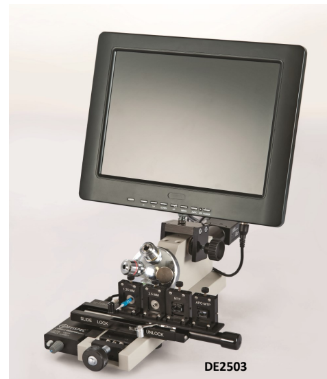
Monitor and adapters sold separately

Our Domaille Engineering OptiSpec® DE2503 video microscope is designed for large and small fiber optic cable assembly companies. The DE2503 accommodates bare fiber inspection as well as all of the standard connectors including the entire MT series of multi-fiber connectors. Blue LED illumination control eliminates previous industry standard light source issues and improves contrast on minor scratches.