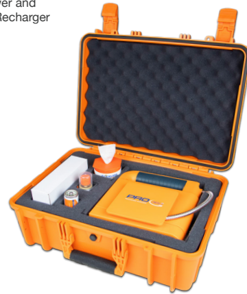
Kit shown with Sticklers Pro360° Touchless Cleaner Tool (MCC-P360) and Sticklers Pro360° Field Kit (MCC-P360FK)