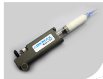
Thumb Activated Micro-Dot Syringe Dispenser (T20000)

Contact the professionals at Fiber Optic Center for a quote or to get more details.