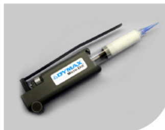
Lever Activated Micro-Dot Syringe Dispenser (T20010)

The Micro-Dot™ portable syringe dispenser offers positive-displacement accuracy for dispense volumes as small as 0.0003 mL. Once a volume is set it can be repeated with accuracy. This syringe dispenser utilizes a pre-packaged disposable syringe as its fluid reservoir, preventing any contact between the fluids and the dispenser eliminating fluid contamination during dispense. With the proper dispense tip selection, the Micro-Dot is suitable for dispensing a wide range of low-to-high viscosity fluids including pastes, lubricants, adhesives, sealants, and more.